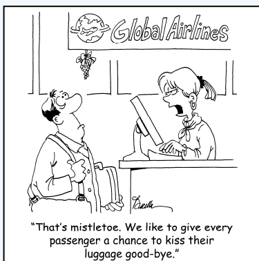
"That's mistletoe. We like to give every passenger a chance to kiss their luggage good-bye."

Unified Threat Management: The New Swiss Army Knife Of Total Security For Your Office.....Page 4